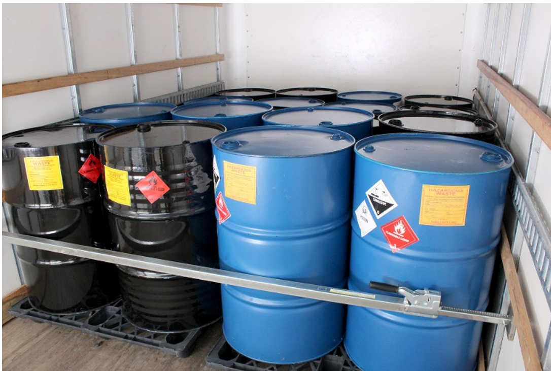
CHEMICAL WASTE STORAGE

Proactive chemical management and responsible disposal.